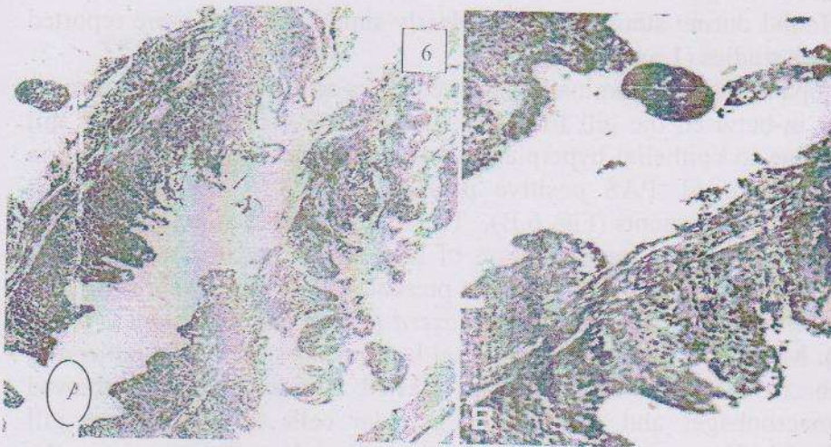
Fig. (6): (A) Gills of C. gariepinus showing cross sections of monogenea in-between gill filament (H & E x 100).