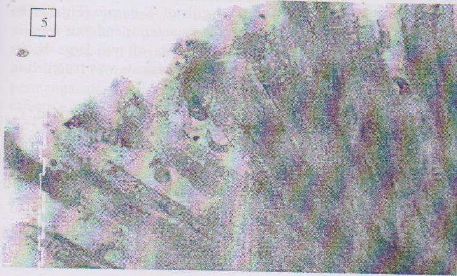
Fig. (5): Gill of C. carpio infested with Dactylogyrus sp. x 4